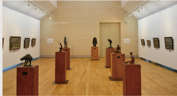
2nd Exhibition Hall

Opened in 1982, exhibiting sculptures and paintings of friends of Ogihara's. 1982年开馆。展示荻原友人的雕刻及绘画。 1982年開館。展示荻原友人的雕刻及繪畫。