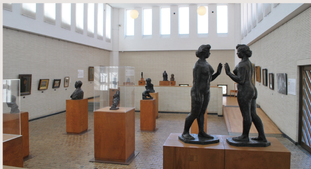
1st Exhibition Hall

Opened in 2008. The 1st floor displays Moriye Ogihara's oil paintings and drawings (exhibition changes in winter). The 2nd Floor is a library and study room. 2008年开馆。1楼：展示荻原守卫的油彩画、素描。（冬季会替换展示）。2楼：图书研修室。 2008年開館。1樓：展示荻原守衛的油彩畫、素描。（冬季會替換展示）。2樓：圖書研修室。